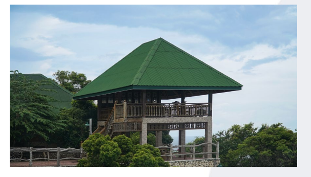
ONDULINE<sup>®</sup> BASE, Green, Malaysia.