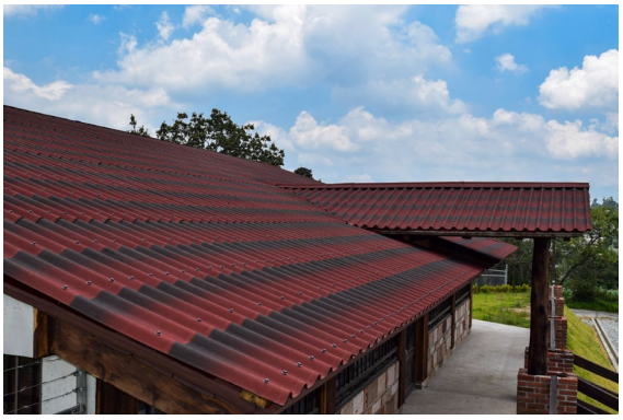
ONDULINE TILE®, Dual Red 3D, Mexico.