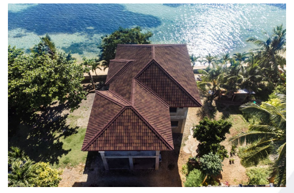
ONDUVILLA®, Shaded Brown, Philippines.