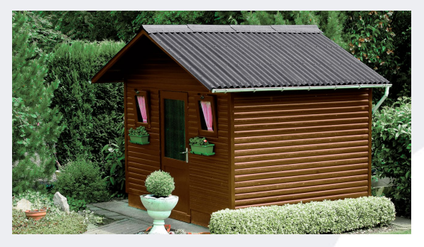
ONDULINE® EASYLINE, Intense Anthracite Grey, UK.