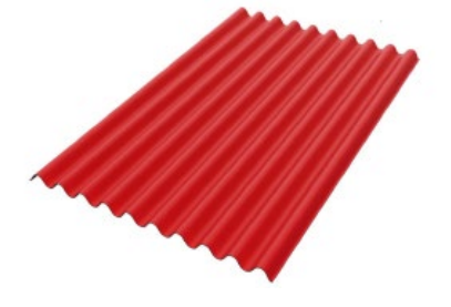
PAINTED is used to maximising colour durability.