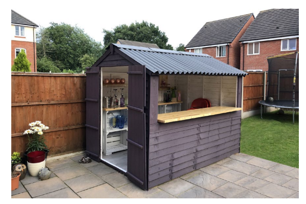
ONDULINE® CLASSIC, Grey, UK.