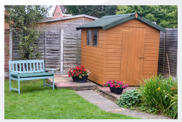
ONDULINE EASYFIX®, Green, UK.