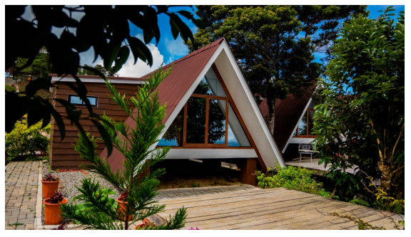
ONDULINE® CLASSIC, Red, Philippines.