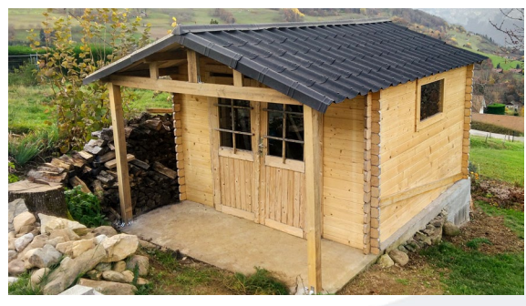
ONDUVILLA<sup>®</sup>, Anthracite Black, Germany.