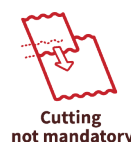
Cutting not mandatory

Overlaps can be exceeded if necessary to avoid cut outs. You can play on the width of the overlaps to avoid cutting .